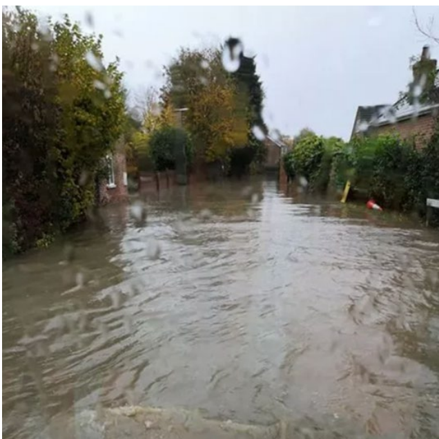
Fields around local horses home flooded November 7, 8 and 9 2019.

Stranded cars, high water levels and road closures. This image is of Fleets Road, Sturton by Stow at the junction with the High Street (B1241) the main thoroughfare through the village. The two roads were flooded over 7, 8 and 9 November 2019 and were closed to traffic along with the A1500 (Tillbridge Lane), which dissects the B1241 also being closed. The flooding also affected Stow Park Road on the outskirts of Sturton by Stow near to the junction to the A1500. Cars that attempted to get through were stranded in the high water levels before police closed the roads. The village school was also closed due to the flooding.