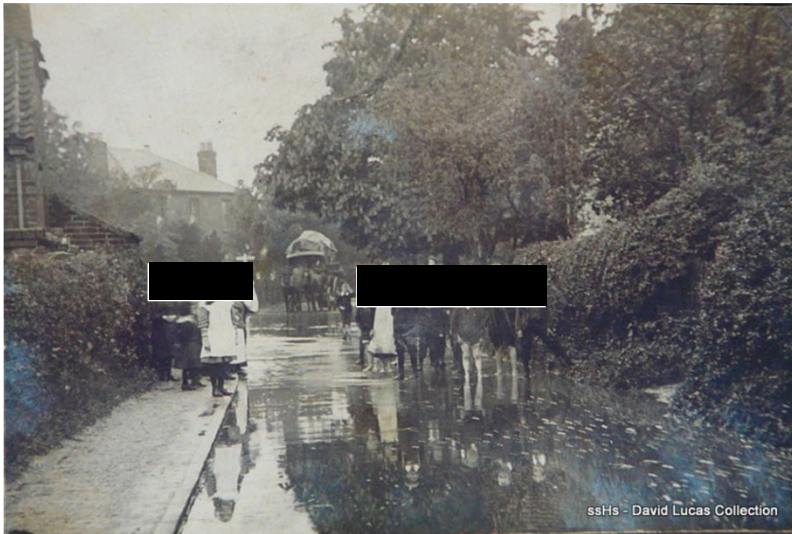
High Street, Sturton by Stow